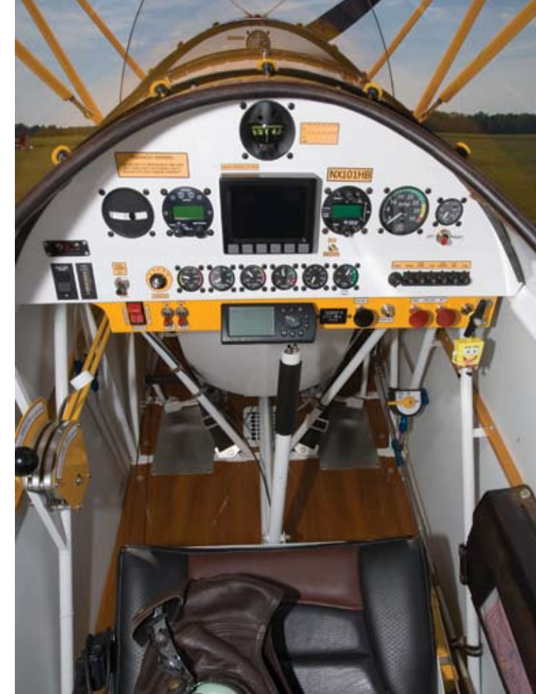
The captain's seat sports a Dynon primary flight display, but is otherwise spartan, as befits a craft intended for VFR, day-only flying.